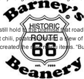
After 91 Years, Barney's Beanery Introduces New Menu