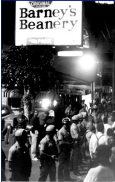
Barney's Beanery in the early 1980s, as protesters demanded that the offending "Fagots (sic) - Stay Out!" sign that hung behind the bar. Photo courtesy "Images of America: West Hollywood" by Ryan Gierach, Arcadia Publishing. WeHo News.

West Hollywood, California (November 30, 2009) - I used to go to Barney's Beanery often in the early 1960's when the place was becoming a notorious gay hangout, although I had no idea that was happening.